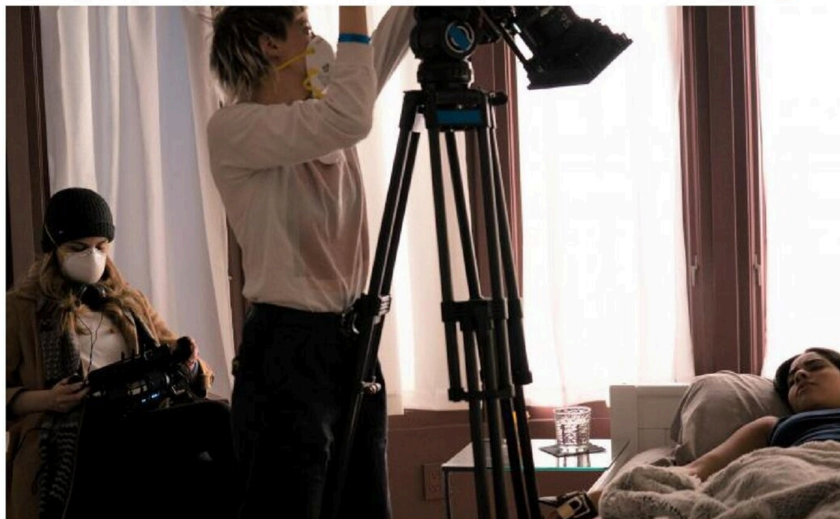
Behind the scenes during "You're Not Safe Here" shoot